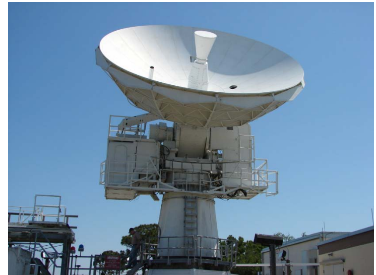
Melbourne, Telemetry Radar