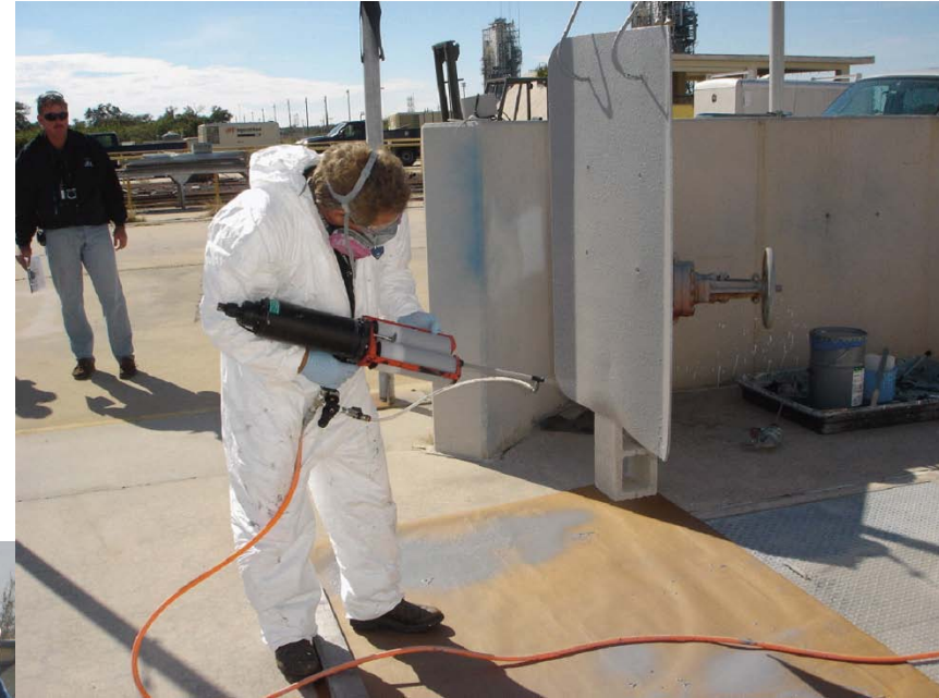
GE Ablative Application