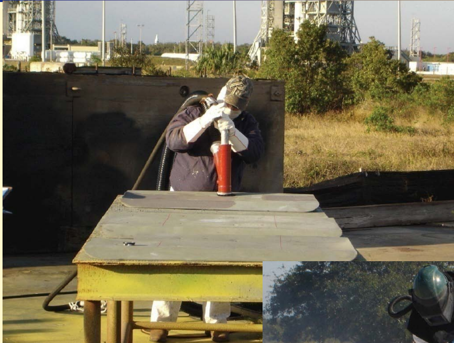
Depaint with Blast Recovery System (BRS)