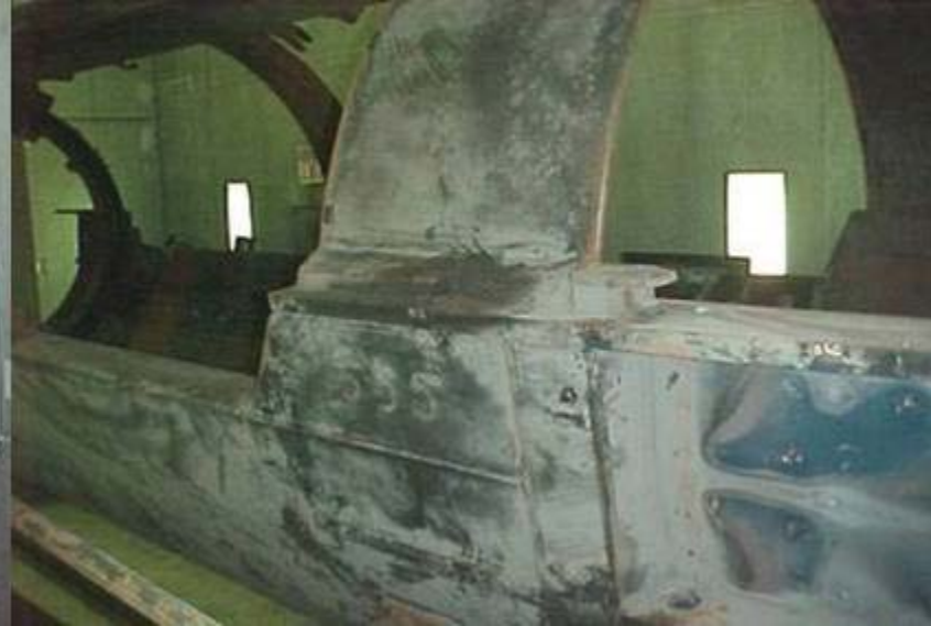
Red-Oxide Primer with Latex Topcoat-Post Launch