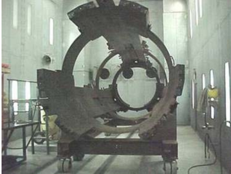
Missile Suspension System (MSS)

CTIO Focus TRLs In-Progress -AFSPC/NASA - OPP 1 - OPP 2 Upcoming - ICBM SE: TE -SLC-VAFB -EAST RNG -MSS